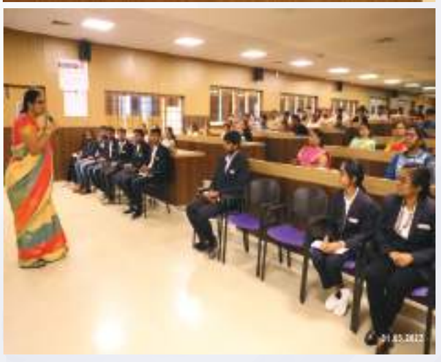
On 31.03.23, the IEEE Signal Processing Student Branch Chapter organized a Seminar titled "Unleashing the Power of IEEE: A Guide to Student Benefits" from 2:00 to 4:30 PM.