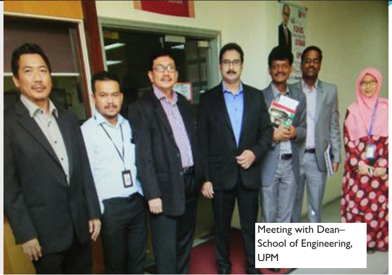
Meeting with Dean – School of Engineering, UPM