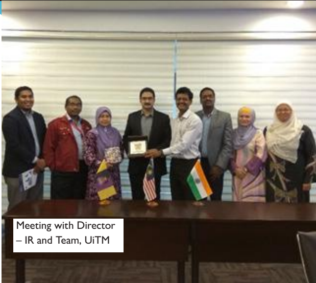
Meeting with Director – IR and Team, UiTM