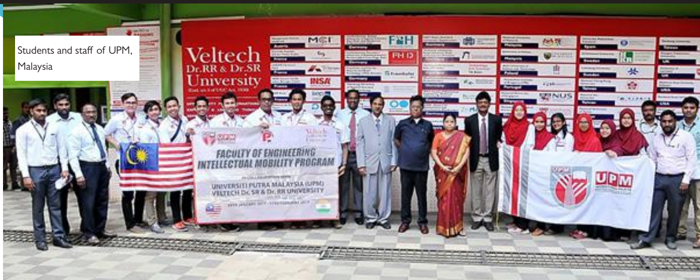
Students and staff of UPM, Malaysia