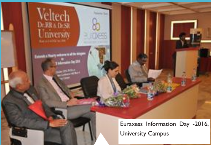
Euraxess Information Day -2016, University Campus