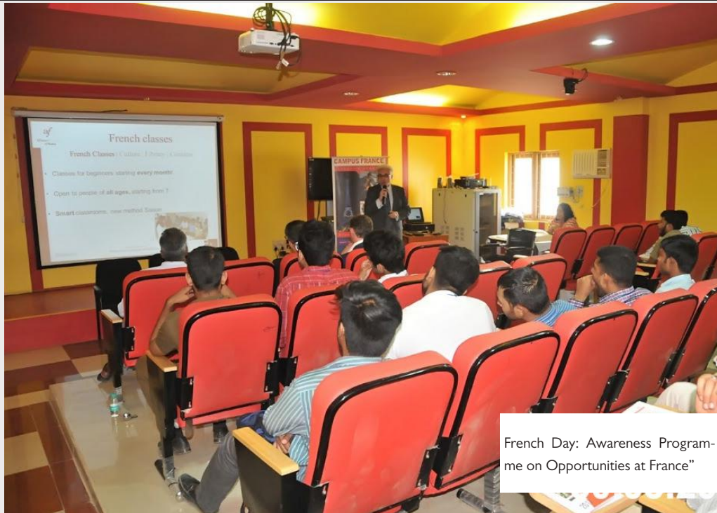
French Day: Awareness Programme on Opportunities at France”